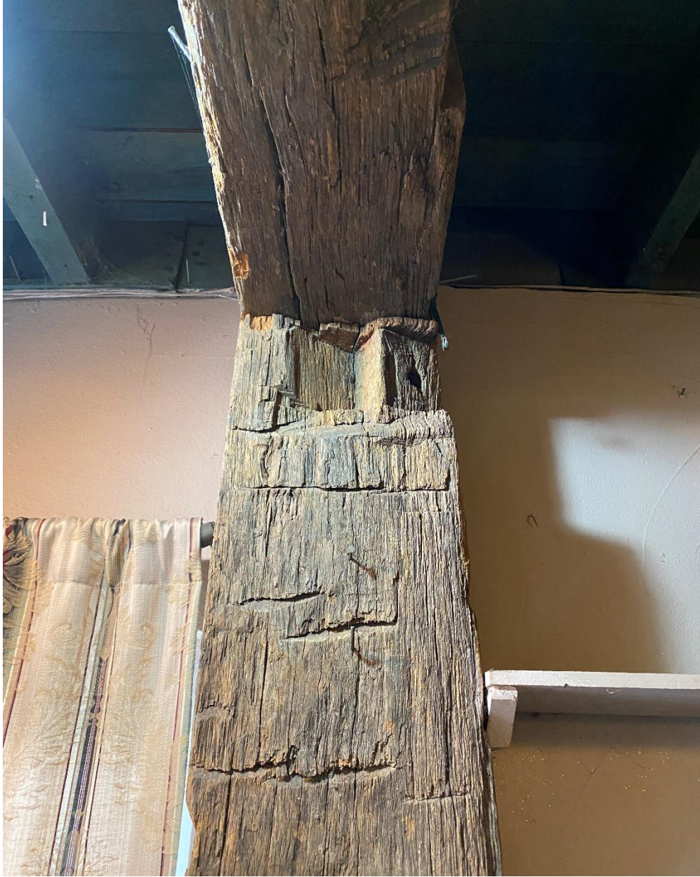
Notch in beam indicates beam was originally used in a different building and used in this building for aesthetic purposes.