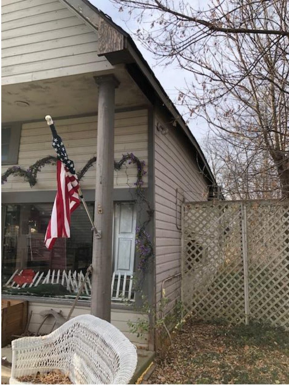
Barn building, north elevation.