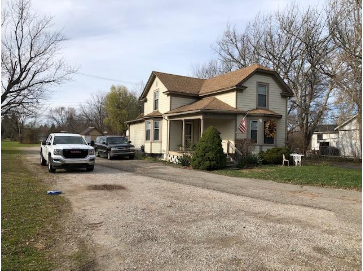
6071 Livernois, looking west from Livernois. The home is in the foreground.