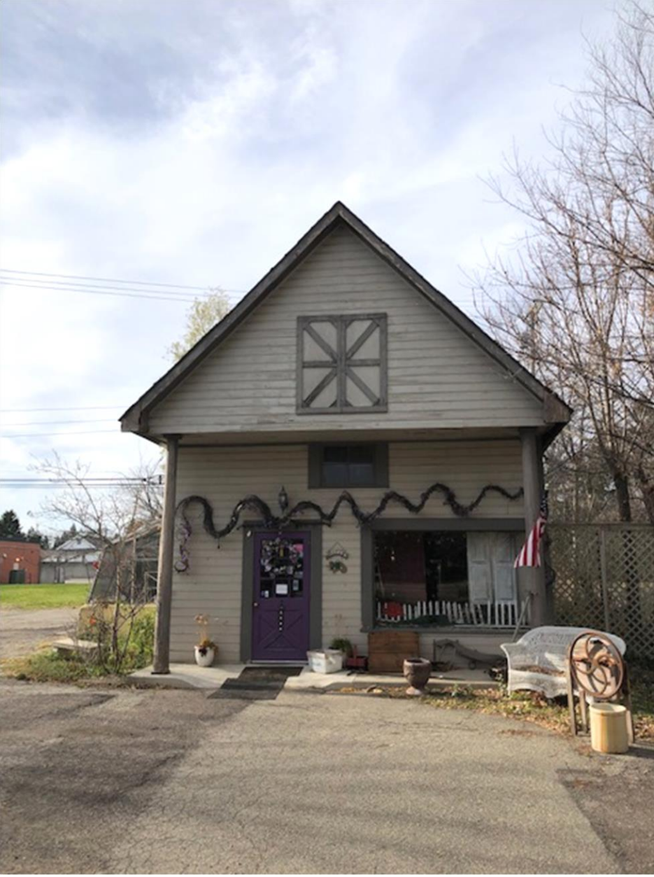
Barn building, south elevation.