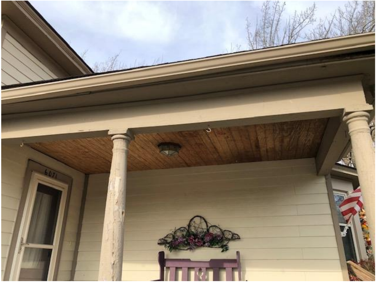
Porch on front of residence.