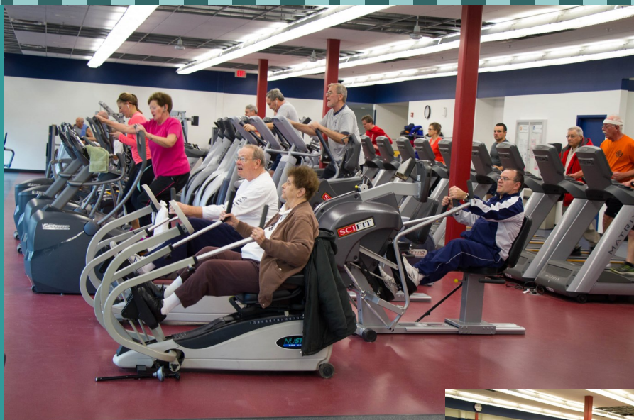
Main Fitness Room

23% of our members are 60 years or older.