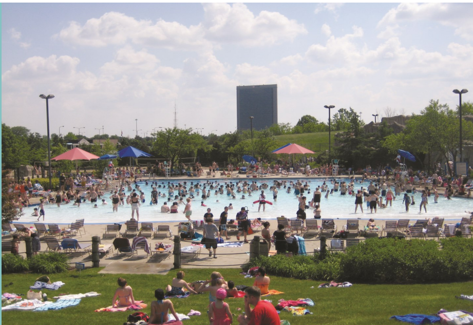
Opening Day 2016