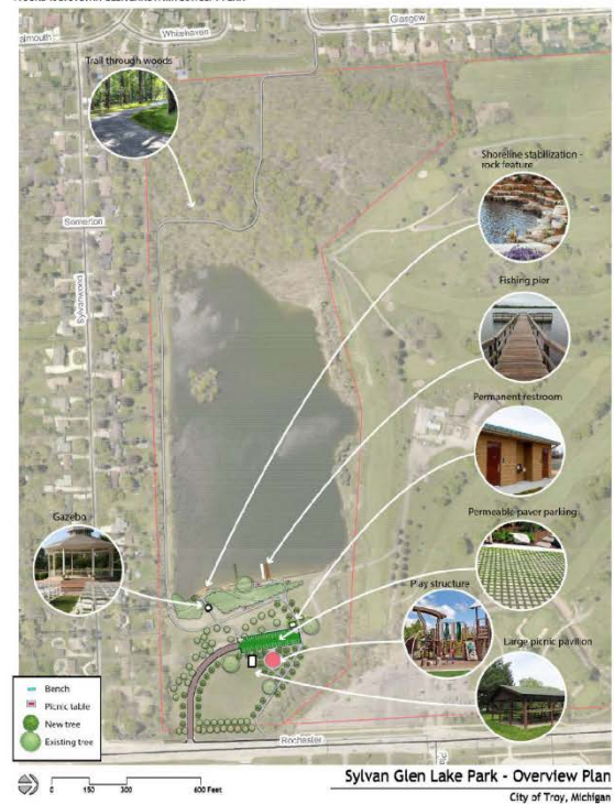
FIGURE 19B: SYLVAN GLEN LAKE PARK CONCEPT PLAN

City of Troy Parks & Recreation Plan 2020 - 2024 97