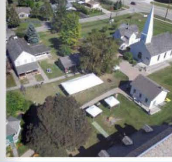
Troy Historic Village included in Parks and Recreation Plan

The Troy Historical Society, established as a 501.c.3 nonprofit corporation in 1966, administers the Troy Historic Village for the City of Troy through a renewable management agreement. Troy Historical Society provides engaging education and enrichment programs at the city-owned Troy Historic Village as well as outreach programs for schools and adult groups. Nearly 30,000 guests visit the Village each year, including 15,000 students, chaperones, and teachers from public, private and charter schools in southeast Michigan. The Troy Historical Society is committed to expanding awareness of the Village as an outstanding center for history education, arts and culture and inclusive community engagement.