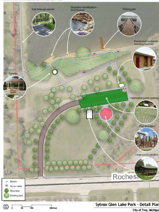
FIGURE 19A: SYLVAN GLEN LAKE PARK CONCEPT PLAN