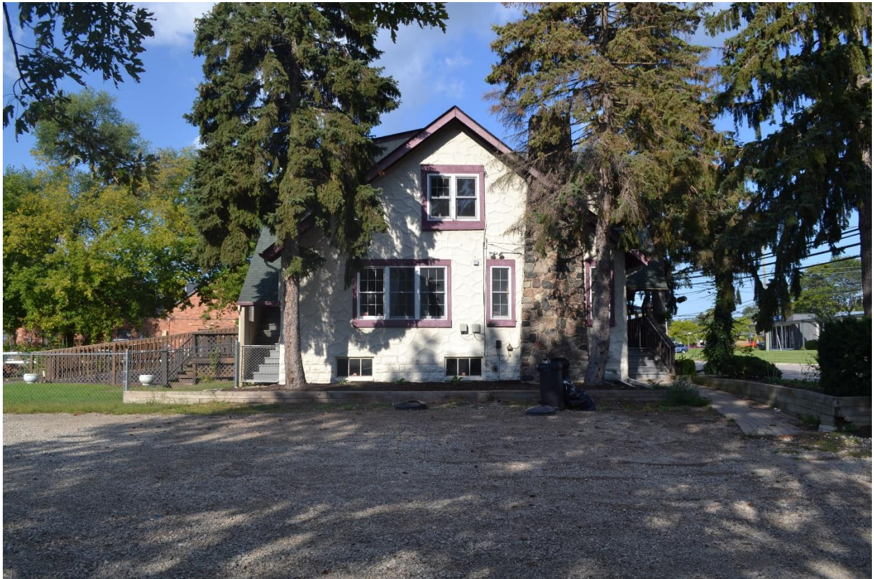
East elevation, image taken facing west - 09-08-21