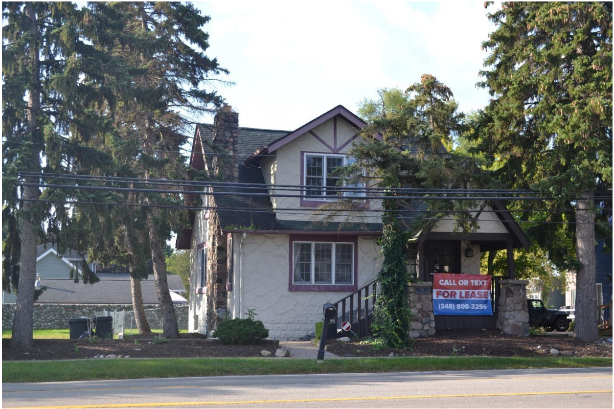
Front façade, image taken facing south - 09-08-21