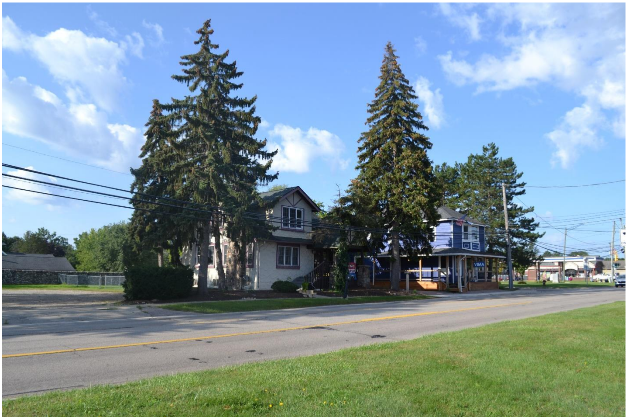
Setting along E. Square Lake Road, image taken facing southwest, intersection of Livernois Road is visible at far right - 09-08-21