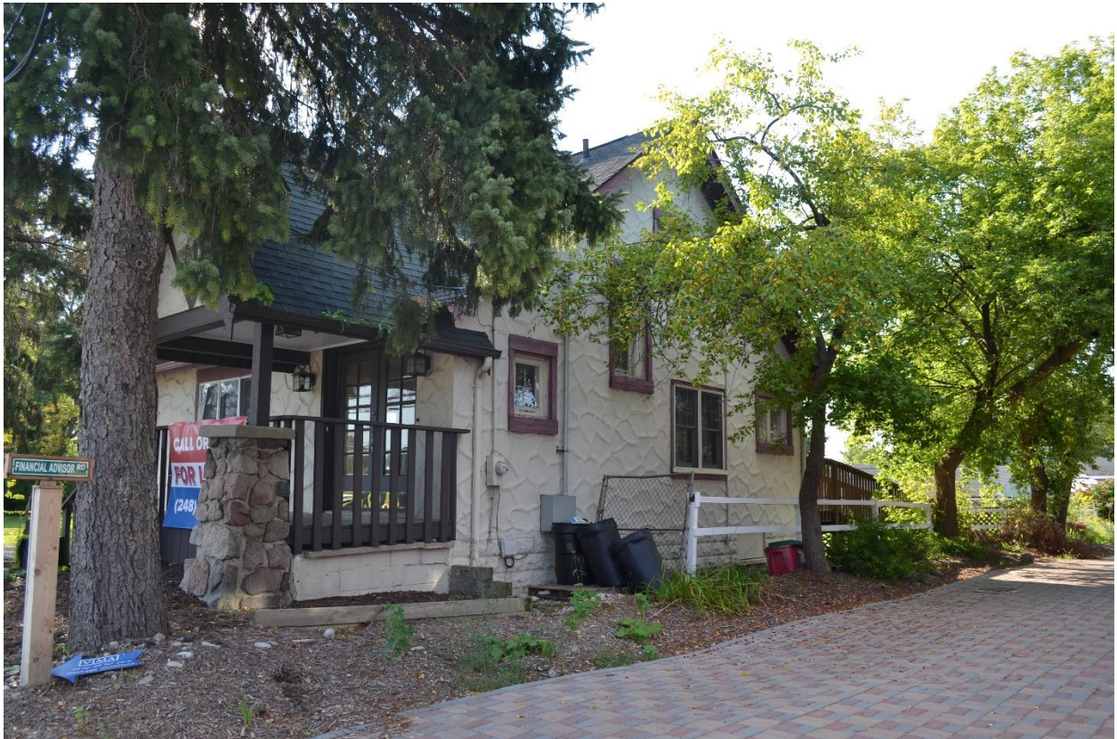
West elevation, image taken from neighboring property facing southeast - 09-08-21