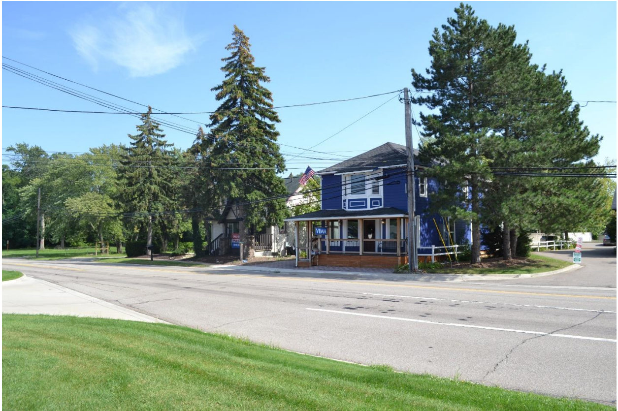
Setting along E. Square Lake Road, image taken facing southeast - 09-08-21