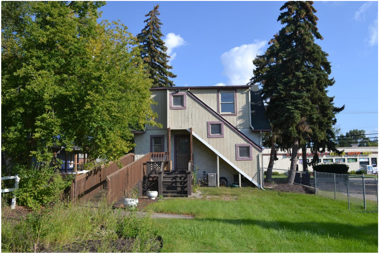
Rear elevation, image taken facing north - 09-08-21