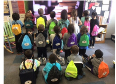
Hill Huskies carrying books for Drop Everything and Read

Each building determined how the Troy Youth Assistance resources could be meaningfully allocated to positively impact the school community. Some investment of funds included purchasing consumable materials for service-learning projects throughout the community, contributing to March Is Reading Month shared experiences for each child to receive the same book, and partnerships with social emotional learning programs to name a few. Participants expressed gratitude for the opportunity to allocate resources targeted toward enhancing the focus on equity and sense of belonging of all members of their school community.