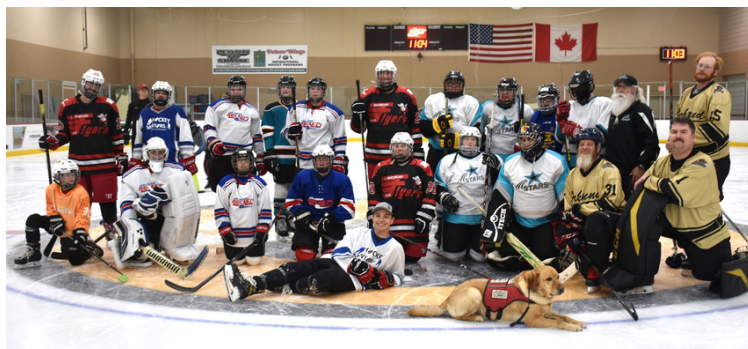
Hockey Mentors for Special Olympians Event, June 11, 2022