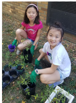
Children at Summer Camp in Troy

Our Camp/Skill Building program was developed to help youth benefit from positive learning experiences designed to enhance self-esteem or develop a specific skill. For the 2021-22 school year, financial assistance was awarded to 28 children ages 7-17 years old to attend programs such as soccer, football, baseball, karate, an 8th grade field trip, tutoring, and summer camps. Scholarships ranged from $80 to $300. Per Troy Youth Assistance policy, parents were required to pay part of the cost, as well as meet financial requirements.