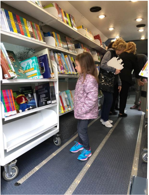
Patrons visiting a bookmobile (Monroe County Library System)